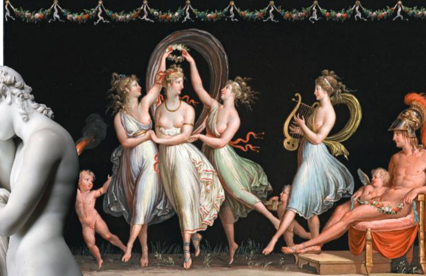
1 Creugas - Plaster figure - Possagno, Antonio Canova Museum and Plaster Cast Gallery 2 Hercules and Lichas - Bronze - Saint Petersburg, State Hermitage Museum 3 Cupid and Psyche Standing - Marble - Saint Petersburg, State Hermitage Museum 4 Dance of the Graces and Venus in front of Mars - Possagno Antonio Canova Museum and Plaster Cast Gallery